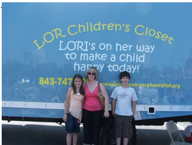
Thanks to all who came out to meet LORI and donate.

LORI has been a Big Hit in Town! Special Thanks to Wal-Mart, Lowes and the Daniel Island Tennis Center.